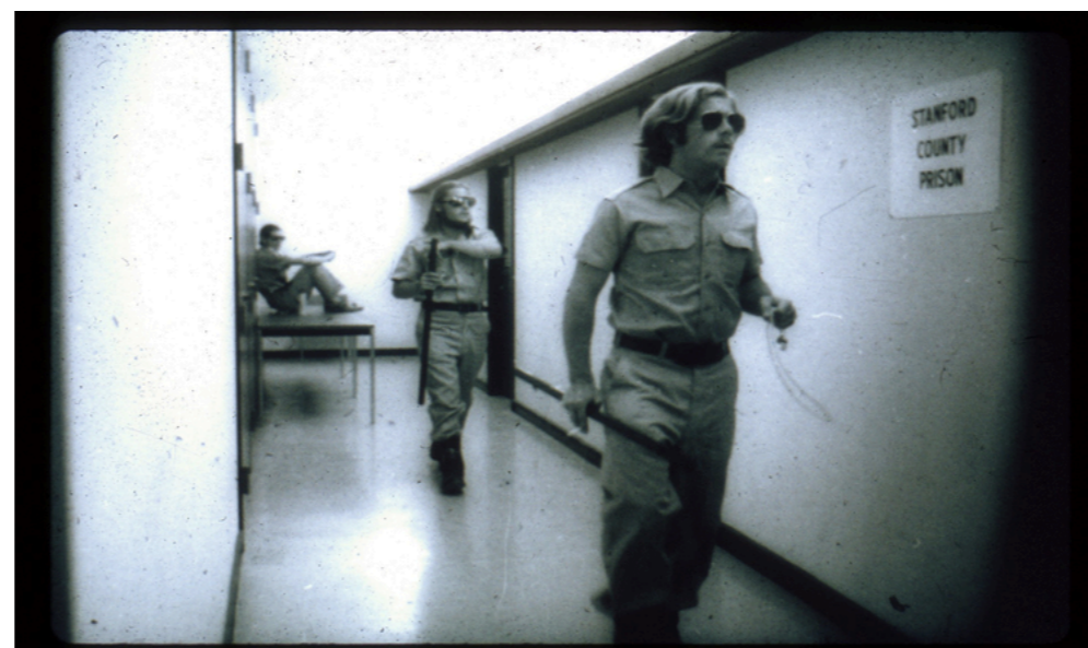
Guards walking in SPE yard

Zimbardo observed the behavior of the prisoners and guards (as a researcher), and also acted as a prison guard