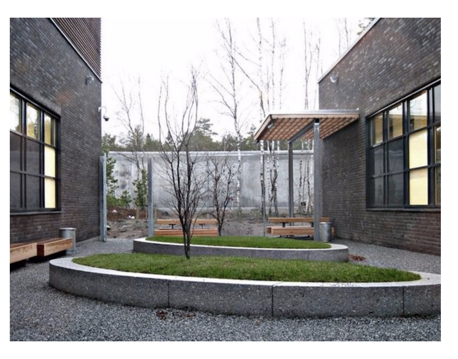
Norwegian Prison, Halden