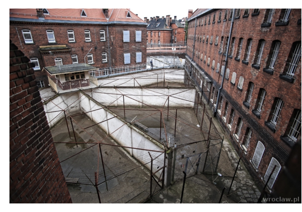
Polish Prison, Wroclaw - Kleczkowska