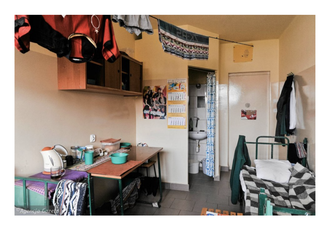
Polish Prison, Wroclaw - Kleczkowska