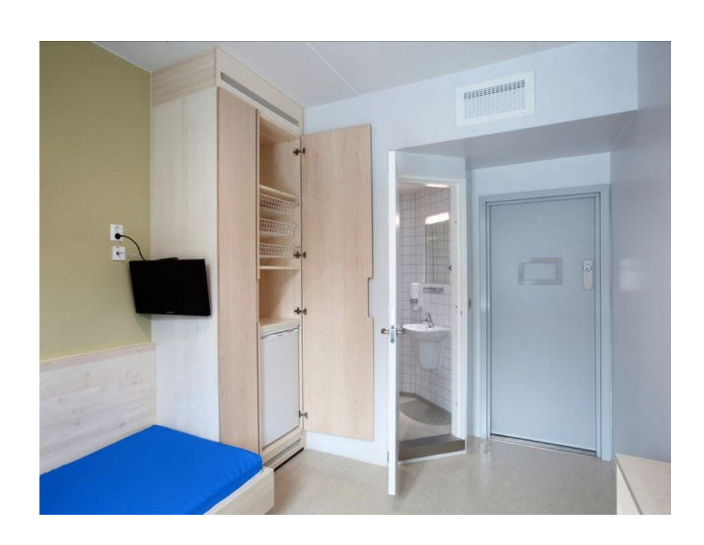
Norwegian Prison, Halden